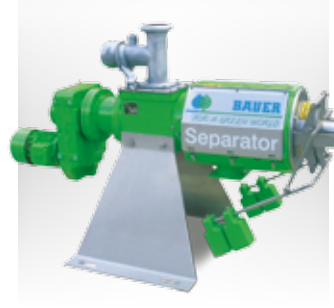
SEPARATOR Press screw separator for solid-liquid separation