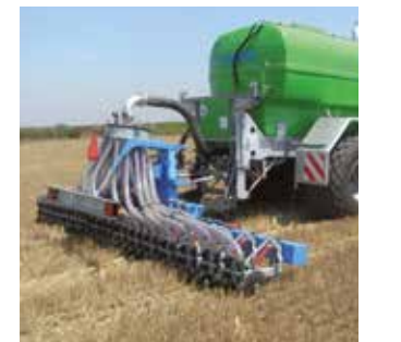
Slurry injector Innovative spreading technology