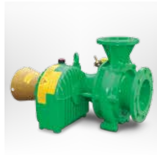
MAGNUM SM Thick matter pump gear unit design