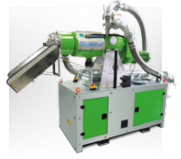
SEPARATOR PLUG&PLAY System for portable slurry separation