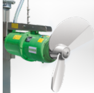
MSXH Submersible motor mixer