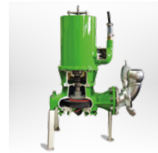
MAGNUM CSPH Submersible motor pump gear unit design