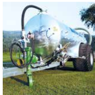
Slurry tankers and polyester tanker Different tanker types for every requirement