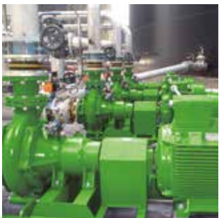
MAGNUM SX Thick matter pump gear and pedestal pump