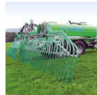
Trailing hose applicator Modular system for all types of tankers