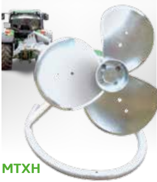
MTXH Tractor mixer