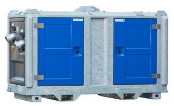
Canopy L10-23 (approx. 40 dB @ 10 m)