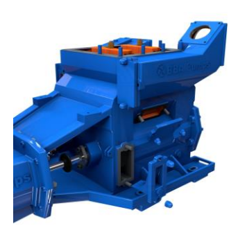
Easy access points Allows access to the cylinders, valves, stuffing boxes and other critical areas for easy cleaning and maintenance.

The stainless steel cylinder liners can be rotated for extended service life. Fitted with a quick release system.