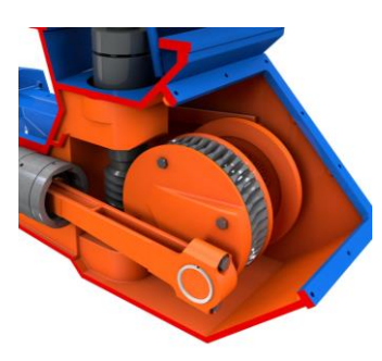
Direct Drive Design <sup>®</sup> Precisely machined drive gears and an automatic lubrication system provide excellent efficiency and minimal sound emissions.

PT150 Electrically Driven High Efficiency Wellpoint Dewatering Pump Max. 90 m<sup>3</sup>/hour, Max. 20 mwc