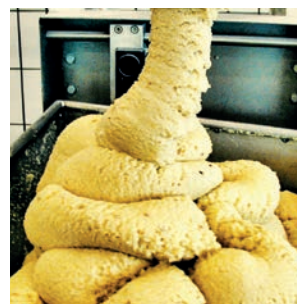
Marzipan mass after pumping