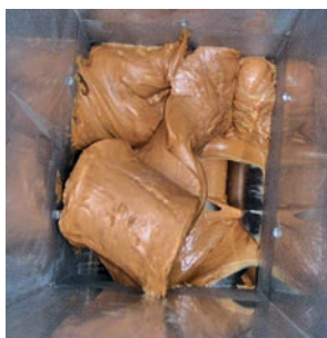
Caramel in the feed funnel