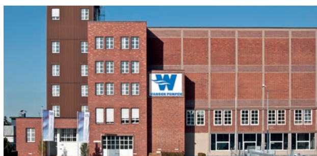
Headquarter building in Wangen, Germany

„WANGEN PUMPEN has developed exactly the solutions that we need for the food industry. Thank you.“