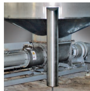
Feed process in a KL100RL120-8 V4A progressing cavity pump